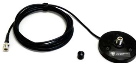
Magnet mount ADM-21/N