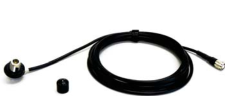
Fixed mount ADN-21/N